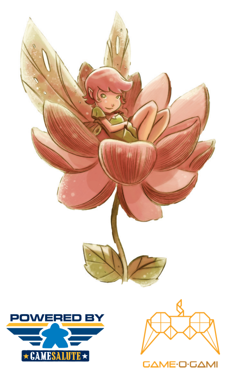
All contents of this game are copyright 2012 by GAME-O-GAMI. Goblins Drool, Fairies Rule! is a trademark of GAME-O-GAMI.